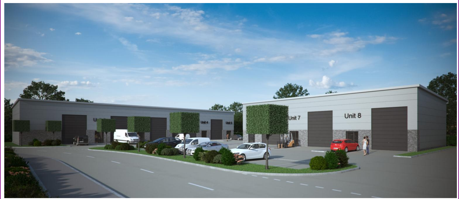
artists impressions and plans for guidance purposes only