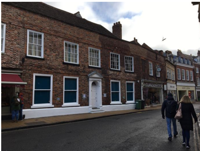
No 3 Blake Street