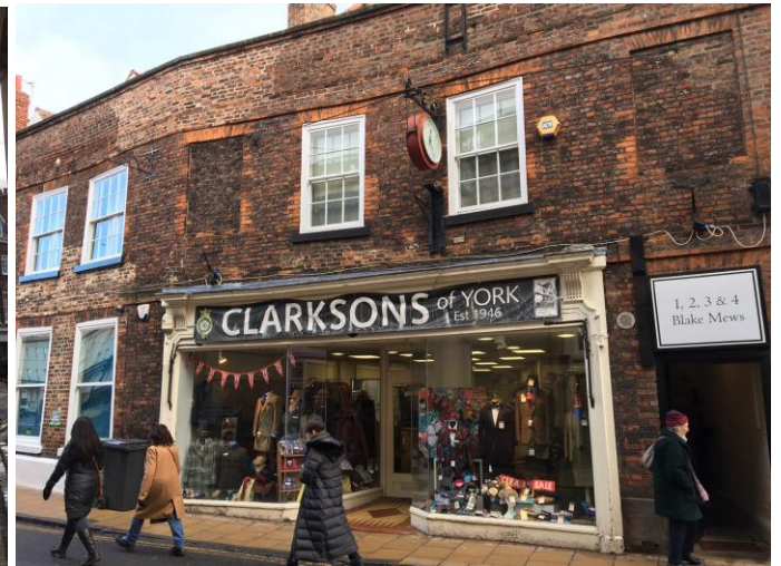
No 5 Blake Street

IMPORTANT NOTICE McBeath Property Consultancy Ltd, their clients and any joint agents give notice that: They have no authority to make or give any representations or warranties in relation to the property. These particulars do not form part of any offer or contract and must not be relied upon as statements or representations of fact. Any areas, measurements or distances are approximate. The text, photographs and plans are for guidance only and are not necessarily comprehensive. It should not be assumed that the property has all necessary planning, building regulation or other consents and McBeath Property Consultancy Ltd have not tested any services, equipment or facilities. Purchasers must satisfy themselves by inspection or otherwise.